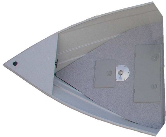
Optional Cast Platform