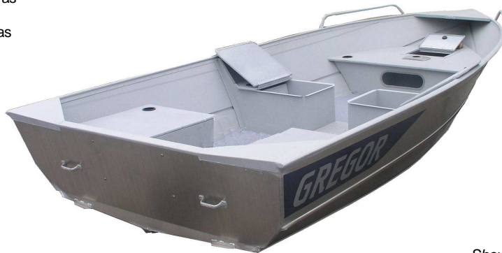
Shown with Optional Floor Boards Casting Platform & Bow Rails