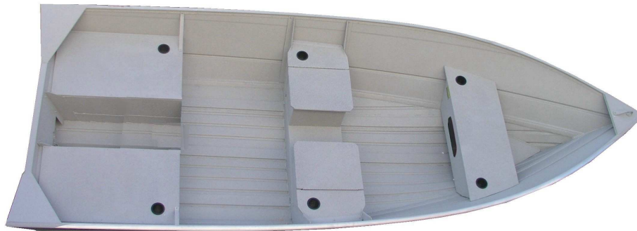
Shown with optional Floor Boards STANDARD FEATURES