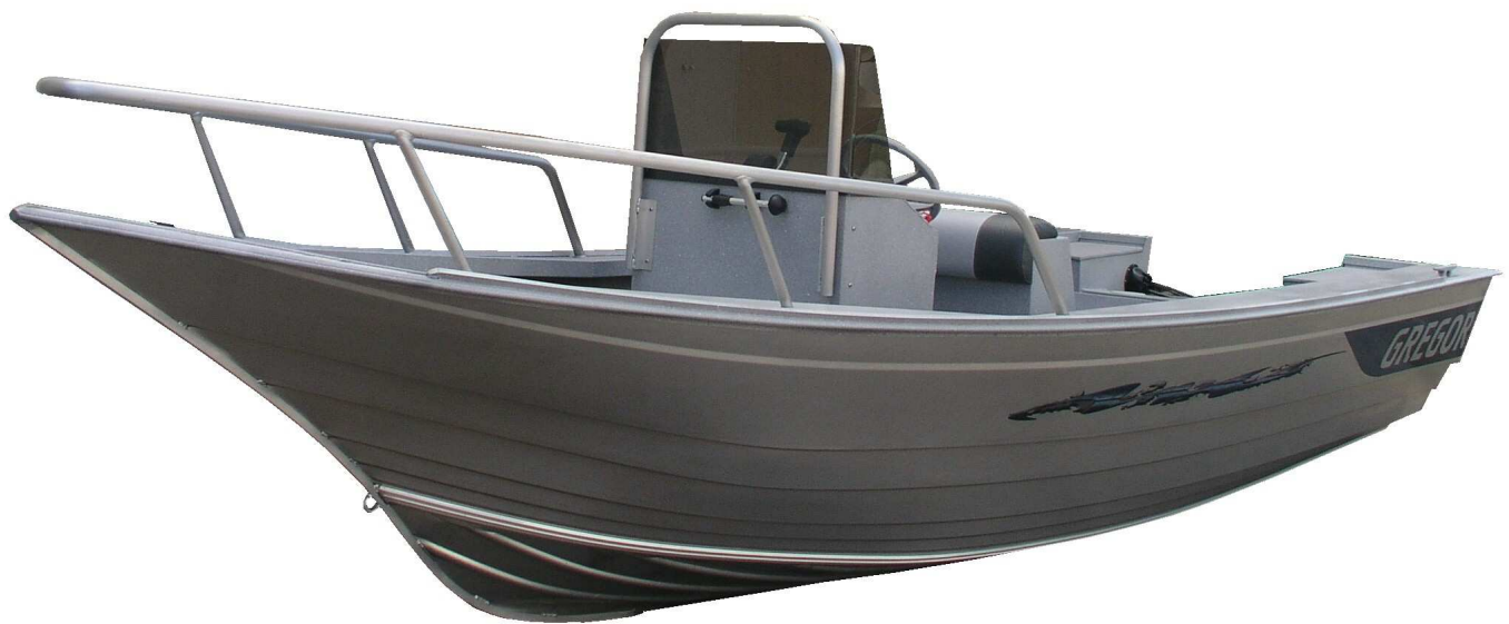
SHOWN WITH OPTIONAL, ENGINE CONTROLS